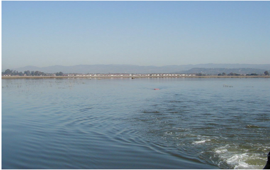
Site 1A-6: Otter trawling down main channel in the South Wetlands Opportunity Area, after levee breach. Looking north. 8 November 2001