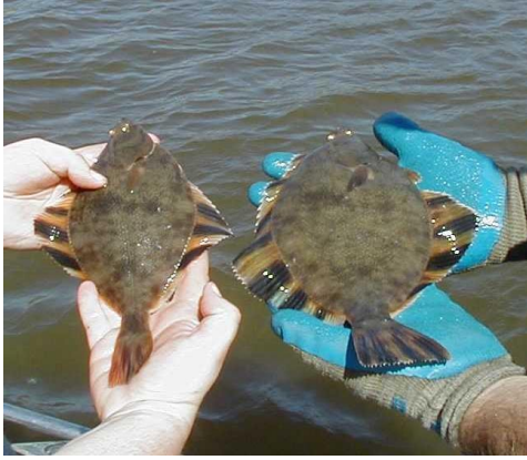
Starry flounder. Captured at Site 1A-1 on September 2001.