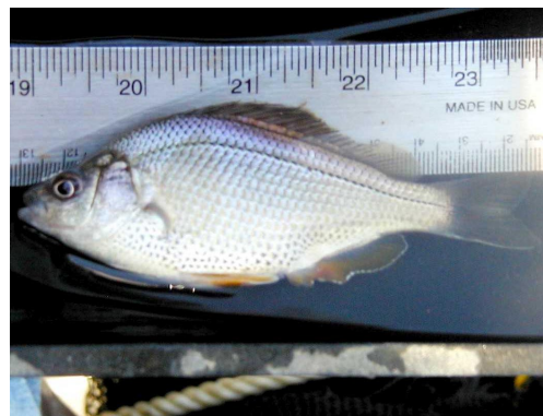
Tule perch. Captured at Site 2-1 on 8 November 2001.