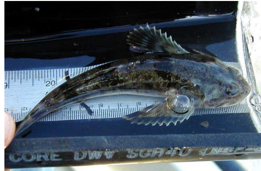
Staghorn sculpin. Captured at Site 1A-1 on 8 November 2001.